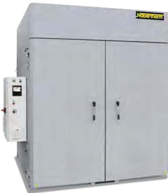
Chamber oven KTR 6125

The chamber ovens of the KTR range can be used for complex drying processes and heat treatment of charges to an application temperature of 260 °C. The high-performance air circulation enables optimum temperature uniformity throughout the work space. A wide range of accessories allow the chamber ovens to be modified to meet specific process requirements.