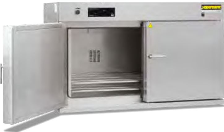
Oven TR 420