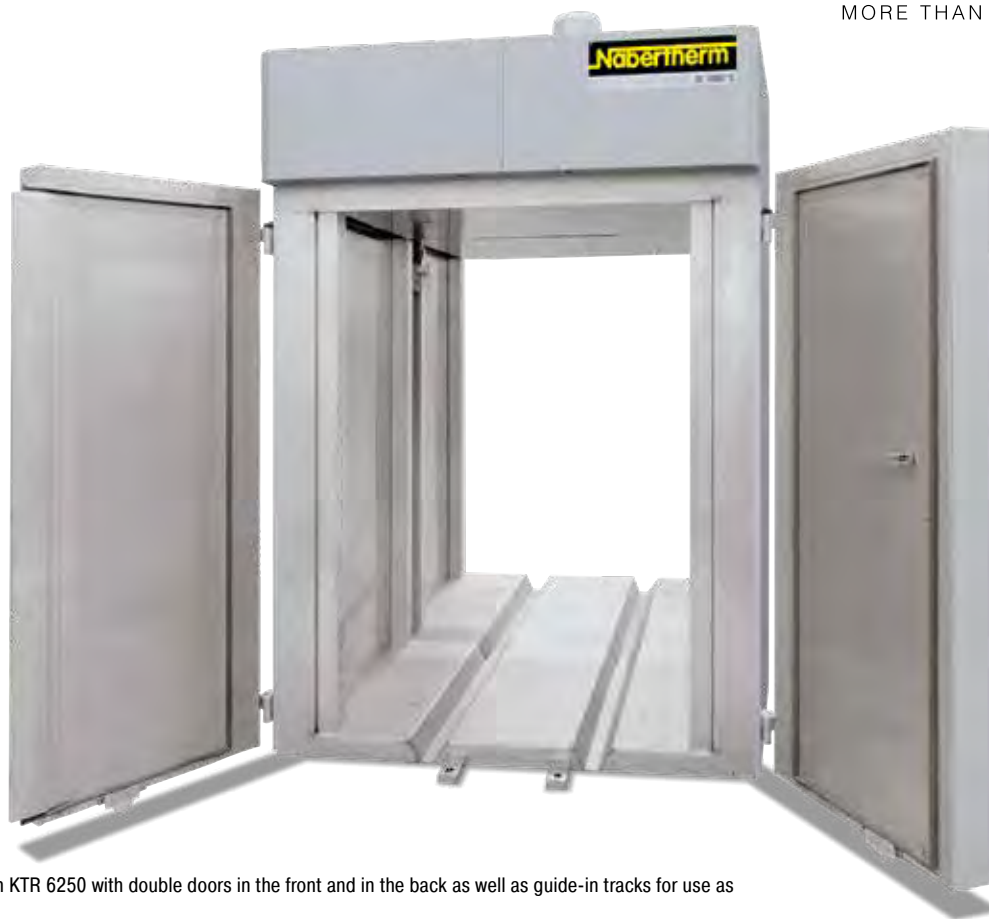
Chamber oven KTR 6250 with double doors in the front and in the back as well as guide-in tracks for use as sluice oven