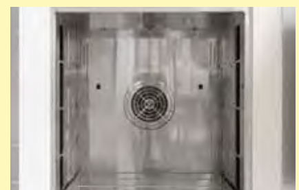
Interior made of stainless steel sheet 1.4828