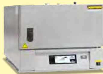
Forced convection chamber furnace NAT 15/85