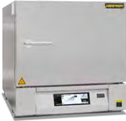
Forced convection chamber furnace NAT 30/85