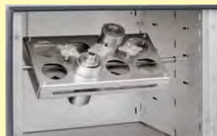
Electrical rotating device (in this case with tailored platform for PARR autoclave containers)