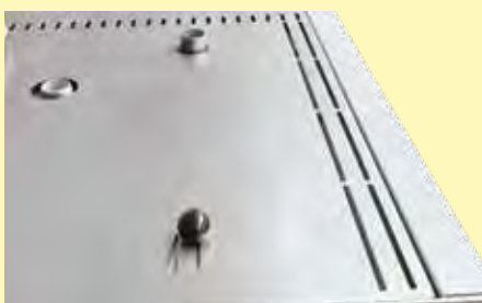
Adjustable exhaust port in the furnace ceiling