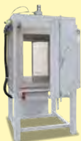
Sluice furnace N 560/26HACLS with safety package, loading from the front and unloading from the back

2 Depending on the furnace design, connected load might be higher