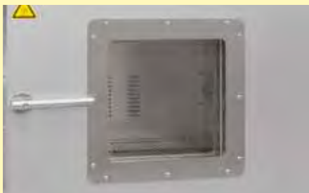
Oven TR 60 with observation window