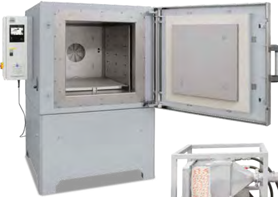
Forced convection chamber furnace NA 250/45