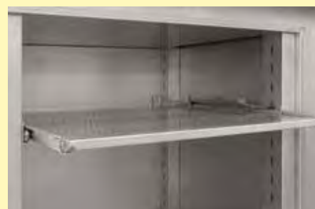
Pull-out shelves, running on rolls