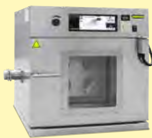
Oven TR 60 S with rotary mechanism