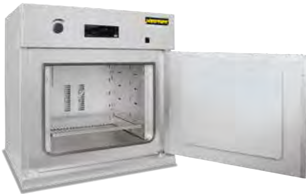
Oven TR 240

With their maximum working temperature of up to 300 °C and forced air circulation, the ovens achieve a very good temperature uniformity. They can be used for various applications such as e.g. drying, sterilizing or warm storing. Short delivery times from stock are ensured for standard models.