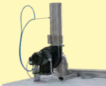
Fresh-air opening and powerful exhaust air fan installed on the furnace