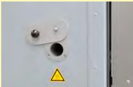
Port for thermocouple