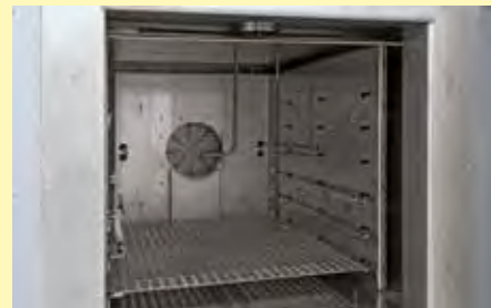
Interior with metal shelf, thermocouples and pressure monitoring