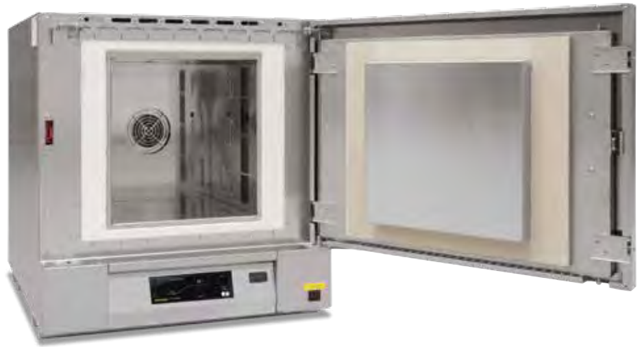
Forced convection chamber furnace NAT 50/85