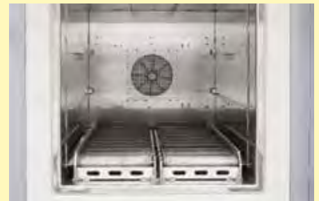
Roller conveyor in furnace chamber