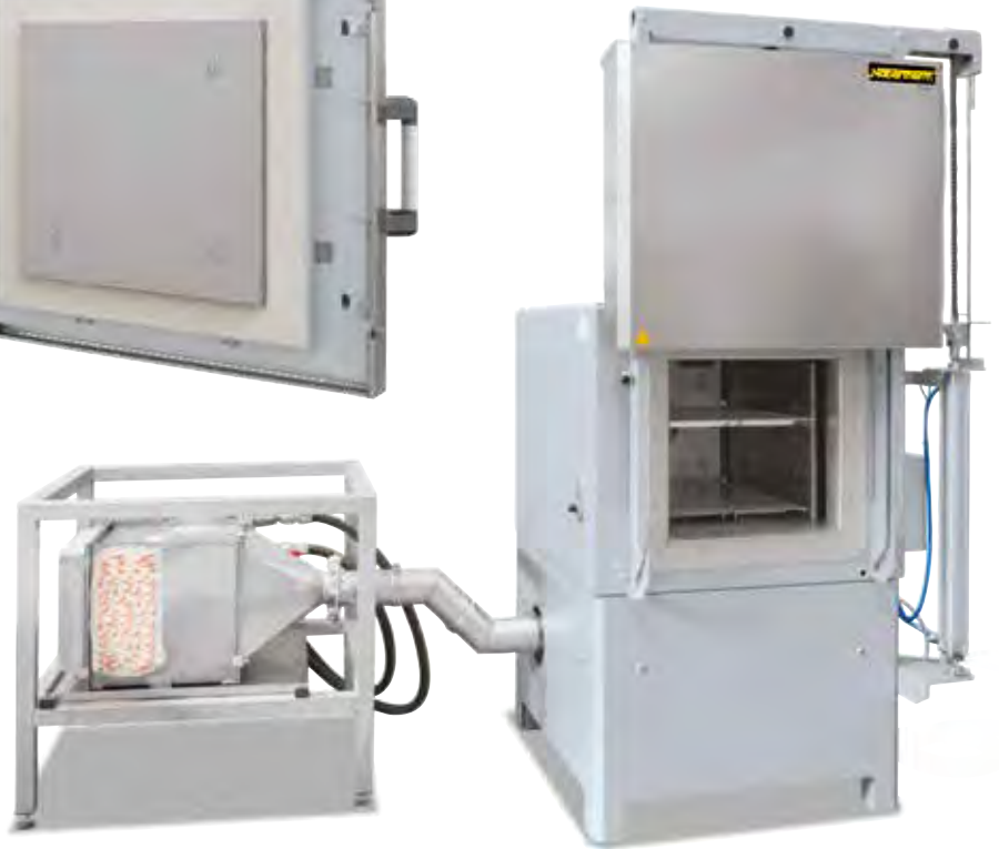
Forced convection chamber furnace NA 120/45 with fresh-air cooling as additional equipment