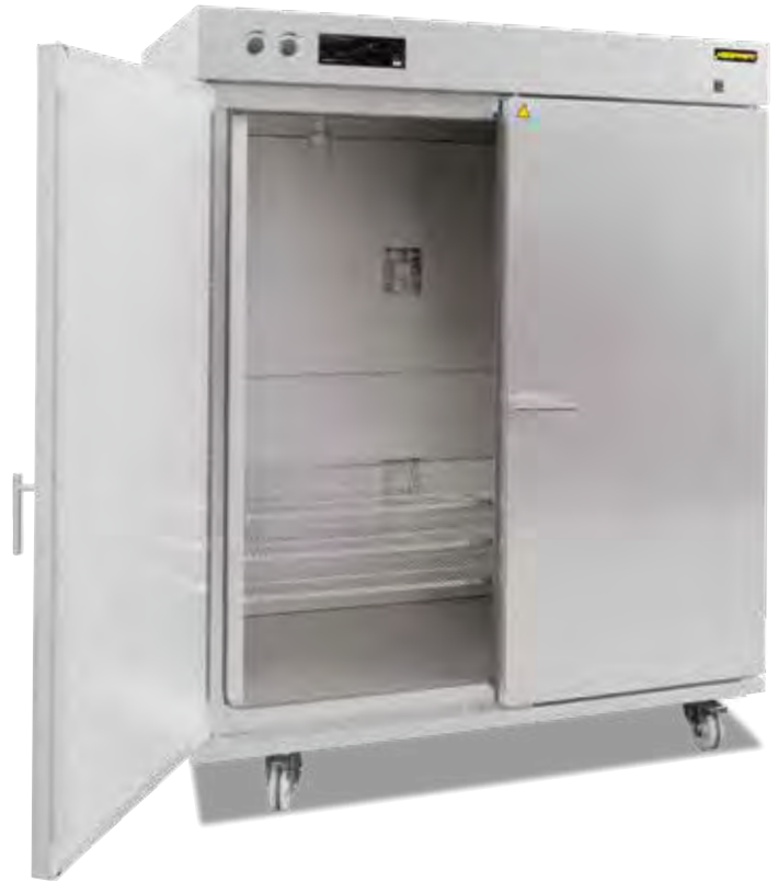
Oven TR 1050 with double door