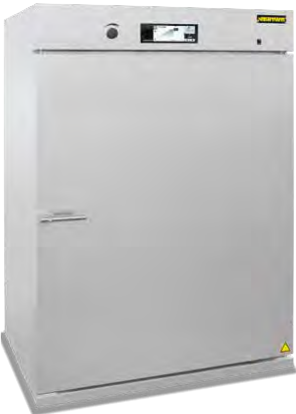
Oven TR 450