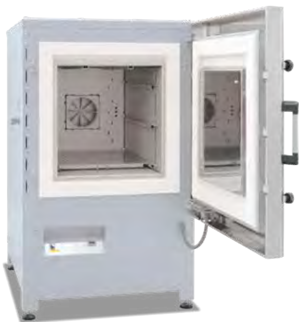
Forced convection chamber furnace NA 250/85