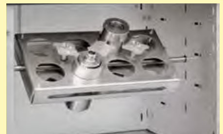
Electrical rotating device (in this case with tailored platform for PARR autoclave containers)