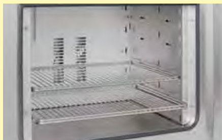
Extricable metal grids to load the oven in different layers