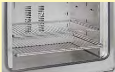
Extricable metal grids to load the oven in different layers

*Please see page 84 for more information about supply voltage