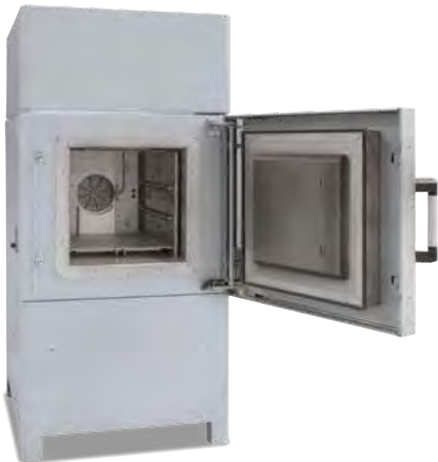
Forced convection chamber furnace NA 120/45 LS

Due to their very good temperature uniformity, these chamber furnaces with air circulation are especially suitable for processes such as drying paints or components with residues of flammable cleaning agents or the evaporation of solvents bound in the components.