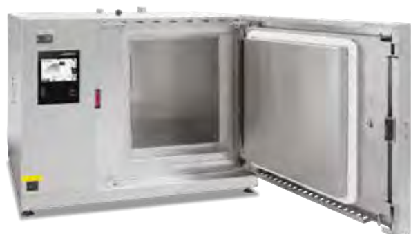
Forced convection chamber furnace NAT 30/65