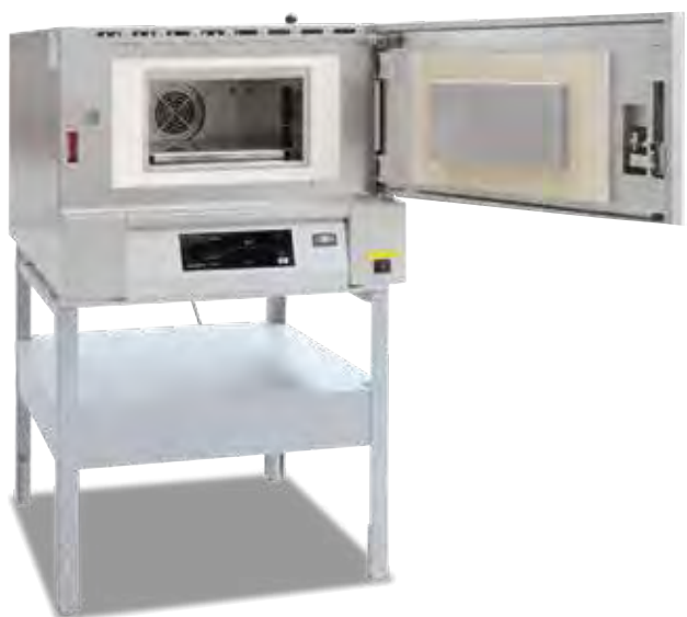
Forced convection chamber furnace NAT 15/85 with base frame as additional equipment

Applications include preheating of components for shrink-fit processes, heat treatment of metals in air such as aging, stress relieving, soft annealing or tempering, and heat treatment of glass.