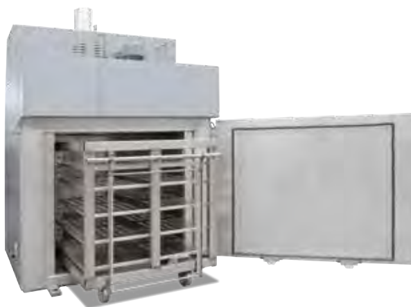
Chamber oven KTR 1500 with charging cart