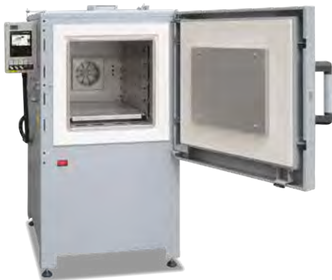
Forced convection chamber furnace NA 120/65

The very good temperature uniformity of these chamber furnace with air circulation provides for ideal process conditions for annealing, curing, solution annealing, artificial ageing, sintering of PTFE, preheating, or soft annealing and brazing. The forced convection chamber furnaces are equipped with a suitable annealing box for soft annealing of copper or tempering of titanium, and also for annealing of steel under non-flammable process gases. The modular forced convection chamber furnace design allows for adaptation to specific process requirements with appropriate accessories.