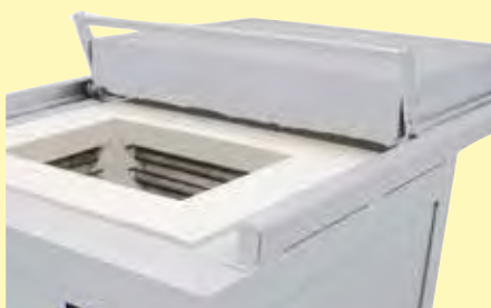
Pit-type furnace S 73/HS with rolling lid

*Please see page 84 for more information about supply voltage