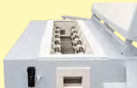
Furnace chamber of gradient furnace GR 1300/13 with second door as additional equipment