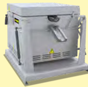
Melting furnace KC 1/14