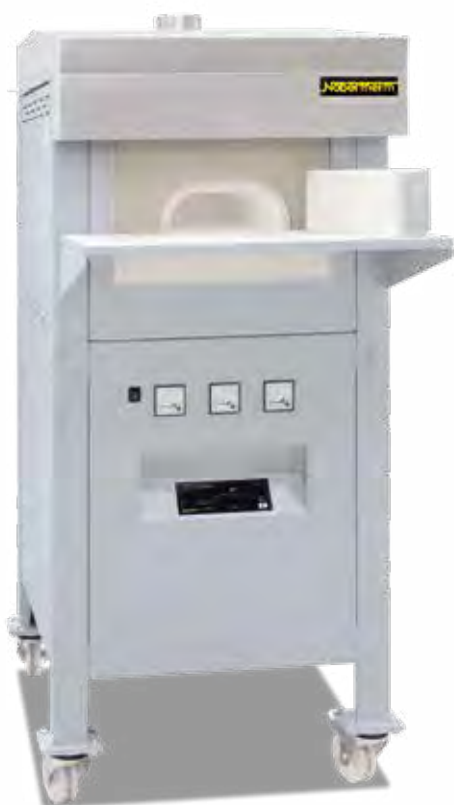
Cupellation furnace N 10/13 CUP with closing brick and base on castors