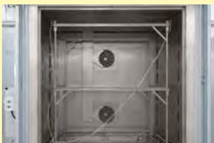
Pluggable frame for measurement for forced convection chamber furnace N 7920/45 HAS

In standard furnaces, temperature uniformity is guaranteed as +/- K without measurement of temperature uniformity. However, as an additional feature, a temperature uniformity measurement at a target temperature in the work space compliant with DIN 17052-1 can be ordered. Depending on the furnace model, a holding frame which is equivalent in size to the work space is inserted into the furnace. This frame holds thermocouples at up to 11 defined measurement positions. The measurement of the temperature uniformity is performed at a target temperature specified by the customer after a static condition has been reached. If necessary, different target temperatures or a defined target working temperature range can also be calibrated.