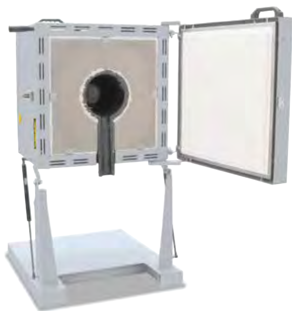
Melting furnace KC 4/14

These compact melting furnaces for the melting of non-ferrous metals and alloys are one of a kind and have a number of technical advantages. Designed as tabletop models, they can be used for many laboratory applications. The practical counter balanced hinge with shock absorbers and the spout (not for KC 4/14) on the front of the furnace make exact dosing easy when pouring the melt. The melting furnaces are available for furnace chamber temperatures of 1000 °C, 1300 °C, or 1400 °C.