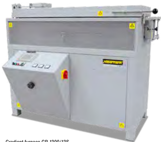
Gradient furnace GR 1300/13S

The furnace chamber of the gradient furnace GR 1300/13 is divided in six control zones of equal length. The temperature in each of the six heating zones is separately controlled. The gradient furnace is usually charged from the side through the parallel swivel door. A maximum temperature gradient of 400 °C can then be stabilized over the heated length of 1300 mm. On request the furnace also is designed as a lab strand annealing furnace with a second door on the opposite side. If the included fiber separator are used charging is carried-out from the top.