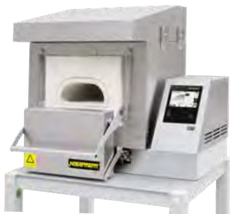
Cupellation furnace N 4/13 CUP as a tabletop model

Cupellation furnaces N 4/13 CUP as a tabletop model and N 10/13 CUP are designed especially for cupellation. Due of its high chamber design, model N 30/13 CUP can also be used for crucible melting. Pit-type furnace S 73/HS is especially designed for crucible melting.