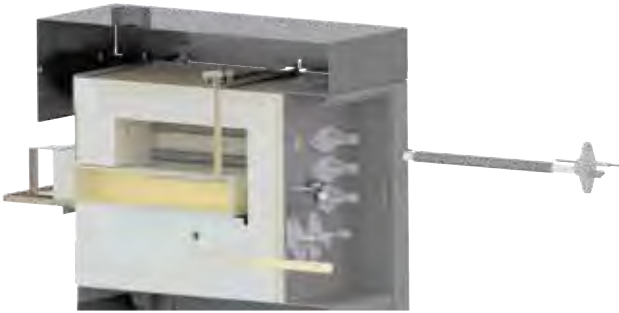
Compact heating element, easy to replace (cupellation furnaces N 10/13 CUP and N 30/13 CUP)