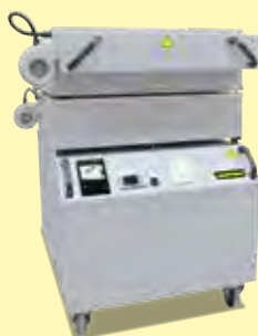
Fast-firing furnace LS 25/13

*Please see page 84 for more information about supply voltage