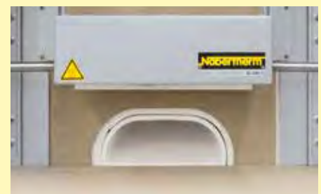
N 10/13 CUP with optional electromotoric lift door