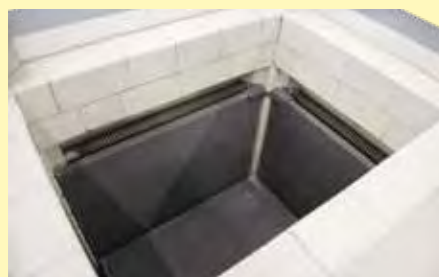
Sides and floor lined with silicon carbide tiles as protection for pit-type furnace S 73/HS