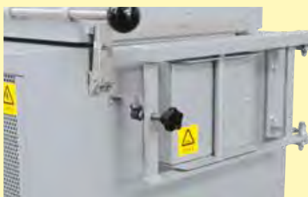
Parallel front swing door

*Please see page 84 for more information about supply voltage