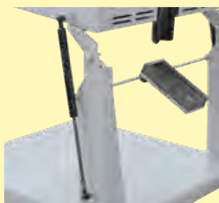
Tilting-aid with dampers

3 External dimensions vary when furnace is equipped with additional equipment. Dimensions on request.