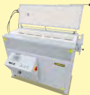
Gradient furnace GR 1300/13S