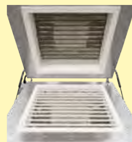
Floor and lid heating, two-zone control