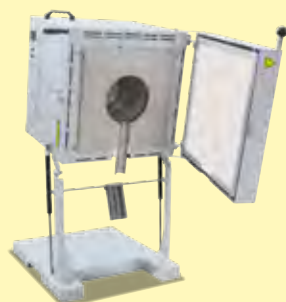
Furnace K 4/10 with steel crucible, e.g. for tin melting