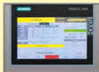
Precision of the controls, e. g. +/- 1 K

The system accuracy is defined by adding the tolerances of the controls, the thermocouple and the work space