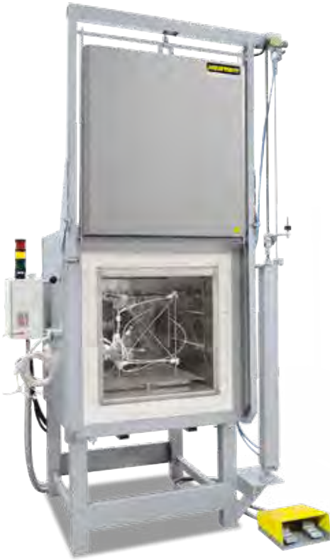
Holding frame for measurement of temperature uniformity

Temperature uniformity is defined as the maximum temperature deviation in the work space of the furnace. There is a general difference between the furnace chamber and the work space. The furnace chamber is the total volume available in the furnace. The work space is smaller than the furnace chamber and describes the volume which can be used for charging.