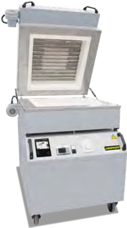
Fast-firing furnace LS 25/13

These fast-firing furnaces are ideal for simulation of typical fast-firing processes up to a maximum firing temperature of 1300 °C. The combination of high performance, low thermal mass and powerful cooling fans provides for cycle times from cold to cold up to 35 minutes with an opening temperature of approx. 300 °C.