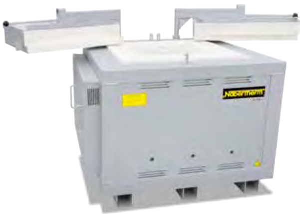
Pit-type furnace S 73/HS with split lid