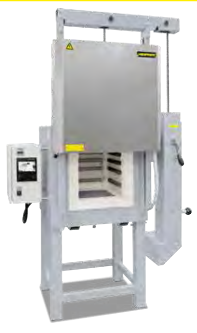
Chamber furnace LH 30/12 with manual lift door