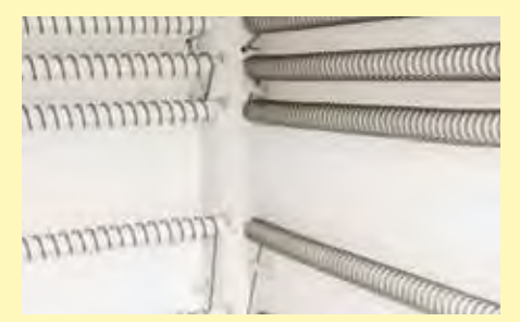
LF furnace design provides for shorter heating and cooling times