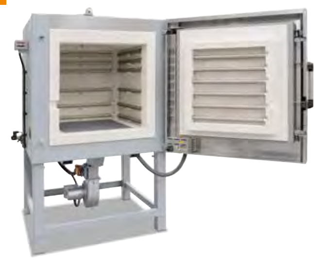
Chamber furnace LH 216/12 with fresh air fan to accelerate the cooling