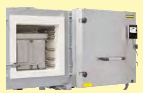
Parallel swinging door for opening when hot