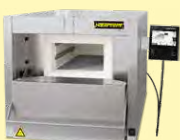
Working with protective gas boxes for a protective gas atmosphere using a charging cart