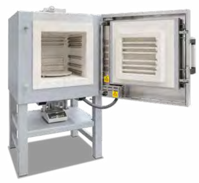
Chamber furnace LH 60/12 SW with scale to measure weight reduction during annealing \,