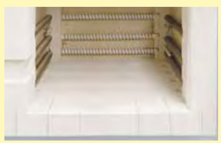
Model with brick base