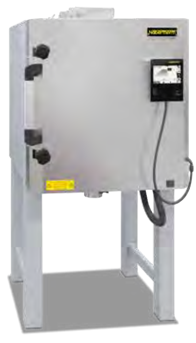
Chamber furnace LH 30/14

These big chamber furnaces LH 15/12 - LF 120/14 have been trusted for many years as professional chamber furnaces for the laboratory. These furnaces are available with either a robust insulation of light refractory bricks (LH models) or with a combination insulation of refractory bricks in the corners and low heat storage, quickly cooling fiber material (LF models). With a wide variety of optional equipment, these chamber furnaces can be optimally adapted to your processes.